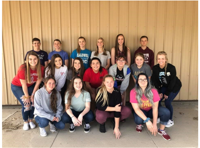
Pictured above are Sumner County TNT (Teens Need Teens) members from Caldwell, Oxford, South Haven, and Wellington. Not pictured: members from Belle Plaine High School.